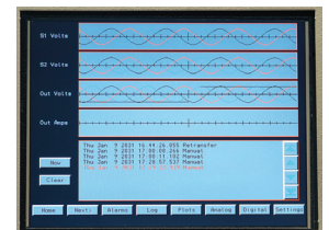
WAVEFORM CAPTURE AND EVENT CAPTURE SCREEN